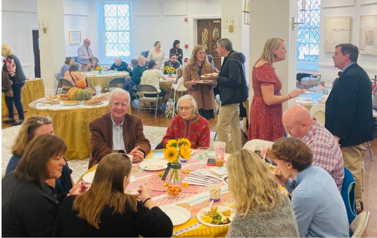
It was another great day in Children's Chapel!